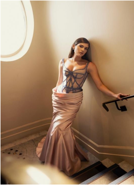
Brazilian model Valentina Sampaio steals the spotlight in a Rami Kadi Couture rosewater crystalized asymmetric bodice gown, featuring an overlapping skirt, from the Mantra Spring Summer 2023 collection, as she attends the “La Passion De Dodin Bouffant” red carpet.