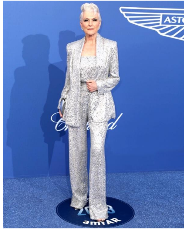
Maye Musk exudes elegance as she attends the Amfar Cannes Gala in a custom-designed Rami Kadi Couture silver-sequined suit.