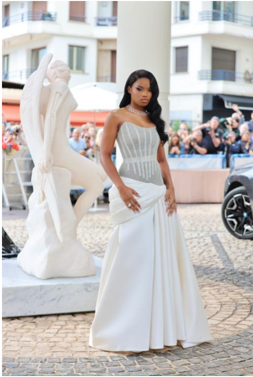
Didi Stone steals the spotlight in a “Mantra” Rami Kadi Couture off-white asymmetric gown adorned with shimmering crystals. Her enchanting presence illuminates ‘The Zone Of Interest’ red carpet.