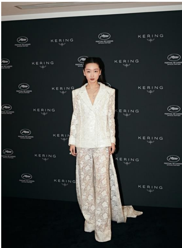
Chinese actress Zhou Dongyu wears a blanc de blanc tailored Rami Kadi Couture suit, as she attends the Kering Official Women Motion Talk, adorned with silk threads and transparent sequins embroidery in a floral motif, featuring a long train.